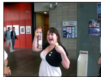
Pictured Above: Student winning a bottle of vodka from the tombola sale.