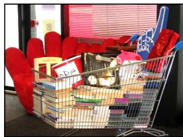
Pictured Above: Shopping trolley with all items donated by members of staff and students from the University of Lincoln.